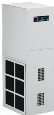
IQ 5000 VXS SS IQ 6000 VXS SS