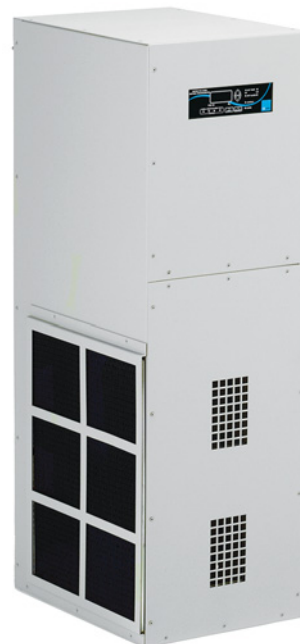
IQ 5000 VXS IQ 6000 VXS