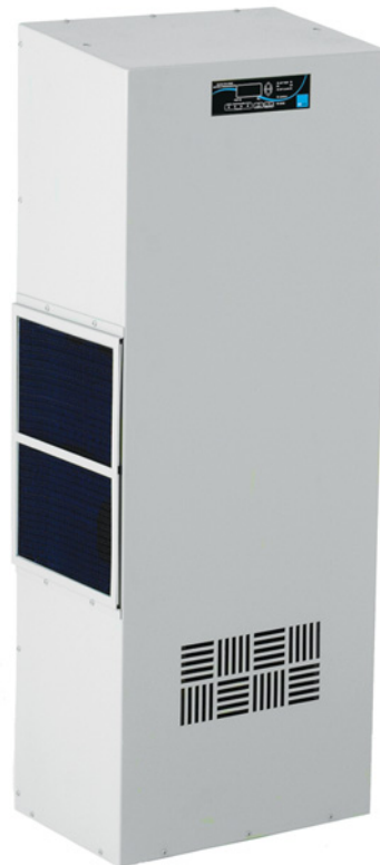
IQ 5000 V16 HA IQ 6000 V16 HA IQ 8000 V16