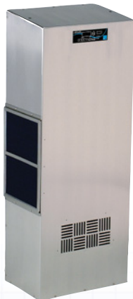
IQ 5000 V16 HA SS IQ 6000 V16 HA SS IQ 8000 V16 SS