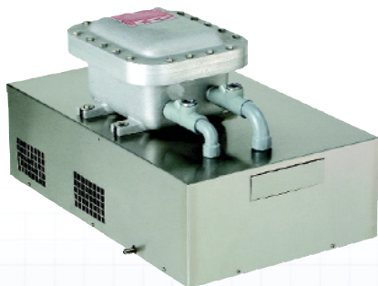
TOP MOUNT IQ 2500 TS XP2 IQ 4000 TS XP2