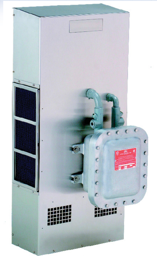
VERTICAL MOUNT IQ 5000 V16 XP2 IQ 6000 V16 XP2 IQ 4000 V16HA XP2